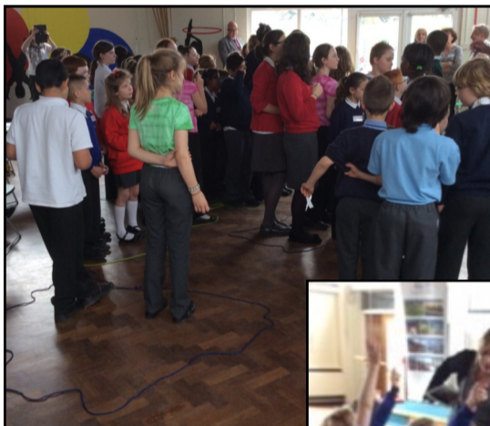
Finding out about global inequalities of resources. One child in particular knew all about the difference between countries and continents! The children are standing in roped marked continents