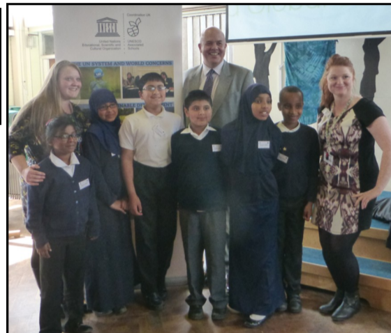
Montgomery Academy pose with the UNESCO rep