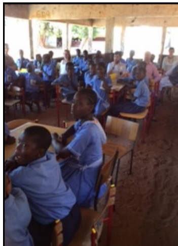
The 'United Nations' in session