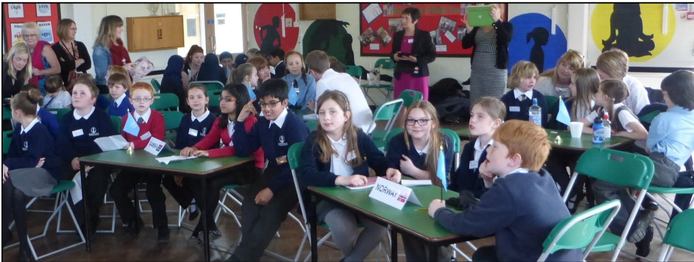
Some of the delegates considering their positions getting ready to vote on the issue