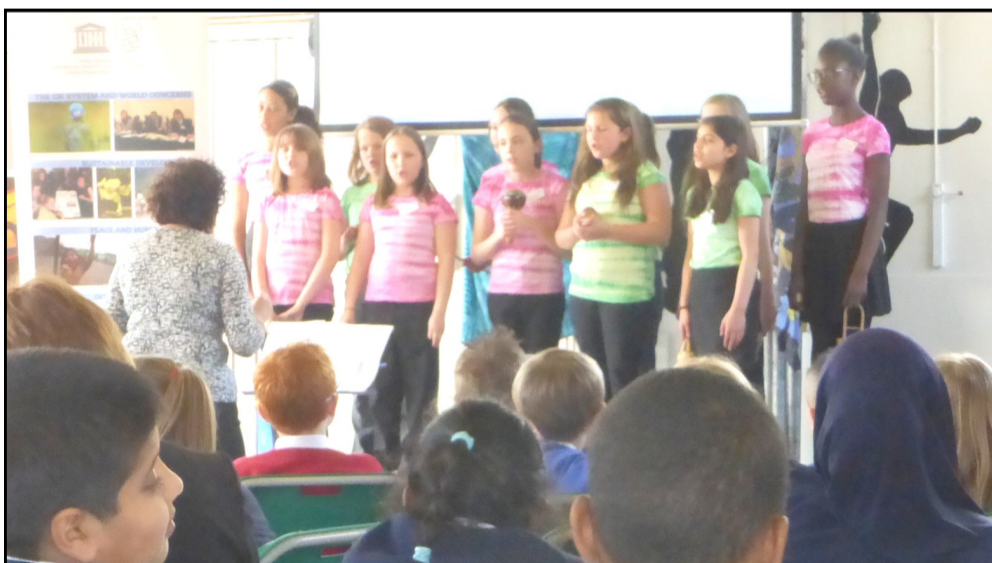
Netherbrook Primary's excellent choir entertains the delegates at the conference