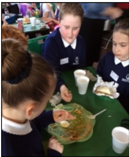
Northfield Road children eating their chicken domada

GLOBAL DIMENSION PARTNERSHIP "Supporting schools in developing the global dimension"